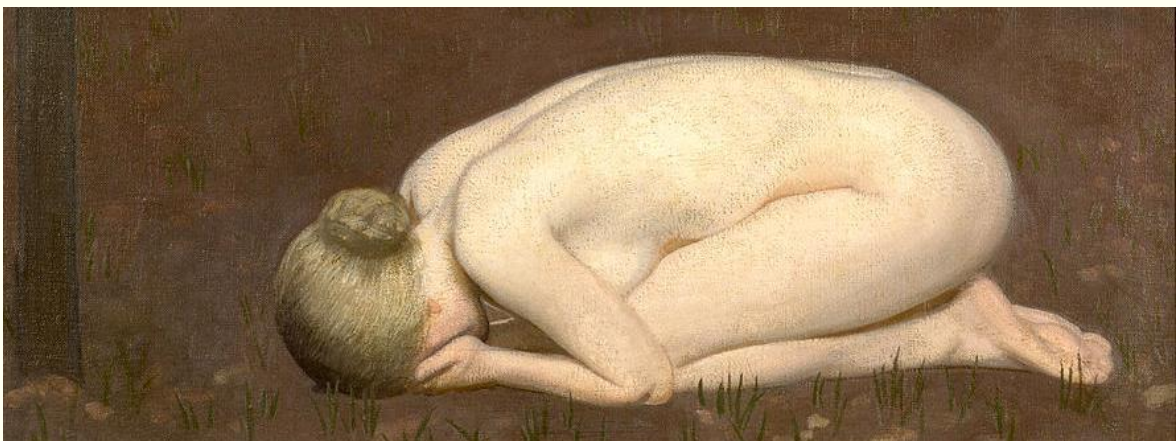
Youth Mourning by Sir George Clausen

Prepare for death by living within the “one eternal Truth, and one infinite changeless Spirit of Love, Truth and Wisdom in the Universe” and by loving, helping, and defending each other against any Spirit of untruth or deception. 1