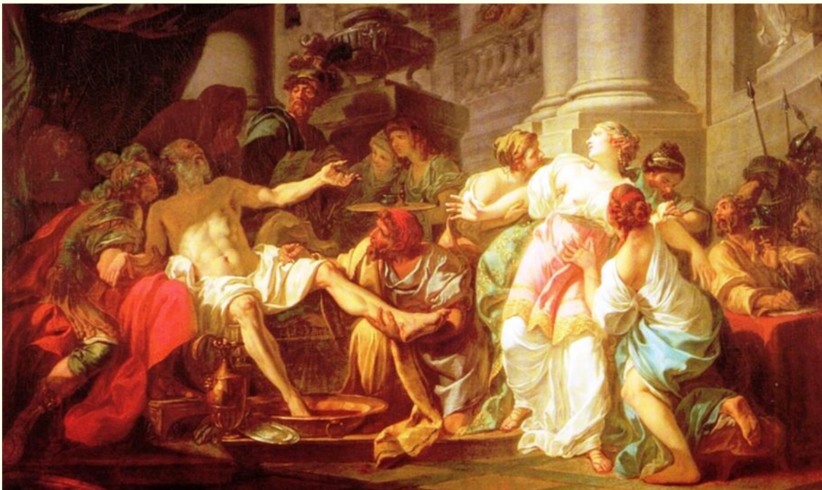
The Death of Seneca (1773) Jacques-Louis David

Truly is life on earth like a day passed in a deep valley surrounded on all sides by high mountains and with a cloudy, stormy sky above our heads. The tall hills conceal from us every horizon, and the dark clouds hide the sun. It is only at the close of the stormy day, that the sunshine, breaking through the clefts of the rocks affords us its glorious light to enable us to catch occasional glimpses of things around, behind and before us. 2