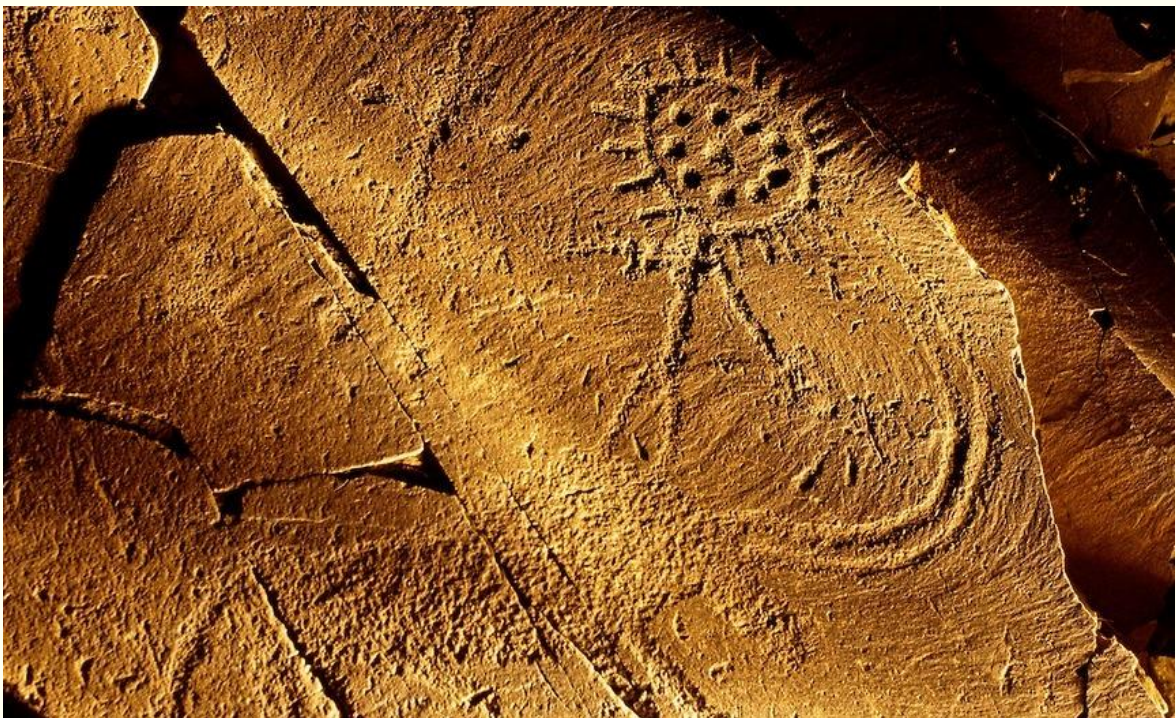
Petroglyph of a rayed sun disc riding a bull, Tamgaly, Kazakhstan The sun-disc contains ten metaphysical points