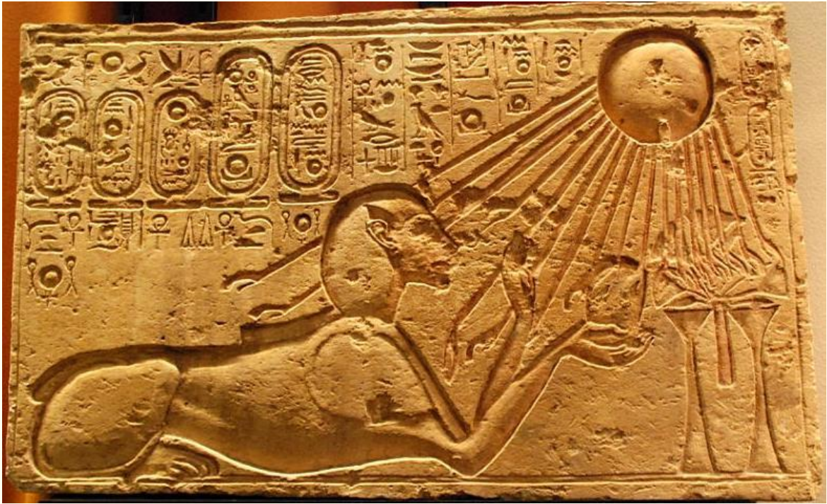
Akhenaten represented as Sphinx, basking in seventeen rays of Aten, Kestner Museum