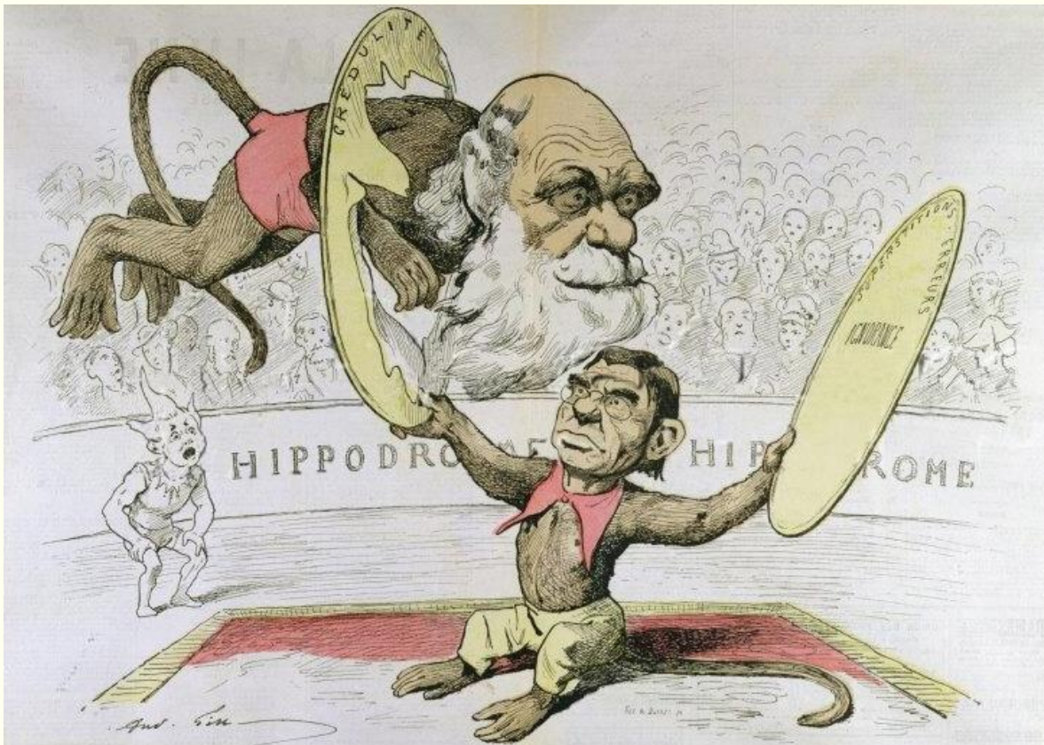
Charles Darwin and Émile Littré depicted as performing monkeys at a circus, breaking through gullibility, superstitions, errors, and ignorance. Caricatured by André Gill (La Lune Rousse, 18 Août 1878)