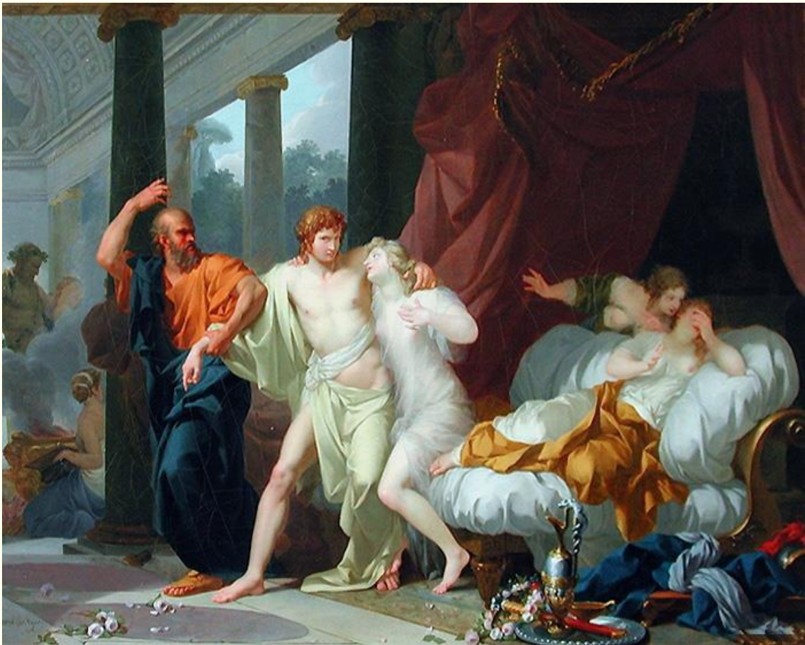
Socrates dragging Alcibiades from the embrace of sensual pleasure (1791) Jean-Baptiste Regnault

ades has risen superior to the multitude of lovers, for on account of his arrogance in their regard he scorned their discordant and disorderly importunity; but as regards the making of provision and the movements within the soul he is overcome by Socrates, since by their means he is persuaded by him that he (Socrates) is “more than anything else worthy” of his earnest attention. Herein is demonstrated how great is the superiority of the inspired over the common lover. The latter is deficient even in the advantages of nature; but these are secondary to movements of the soul; and the latter are perfected only by the inspired lover. “Much more, then,” the geometers would say, would vulgar love be said to be inferior to divine.