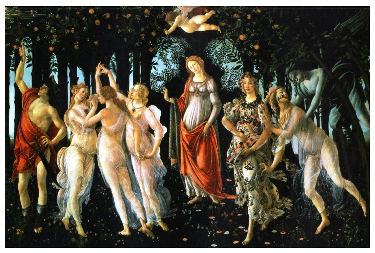
Primavera (c 1482) Sandro Botticelli, Galleria degli Uffizi, Florence