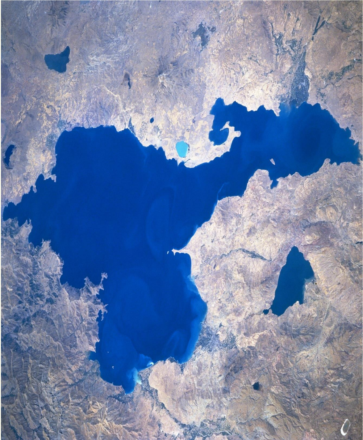
Lake Van (1996), the world's largest endorheic lake. The original outlet from the basin has been blocked by an ancient volcanic eruption. Altitude 1,640 m. Coordinates 38° 38' N – 42° 49' E.